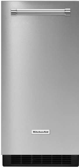
Stainless Steel with PrintShield™ Finish KUIX335HPS