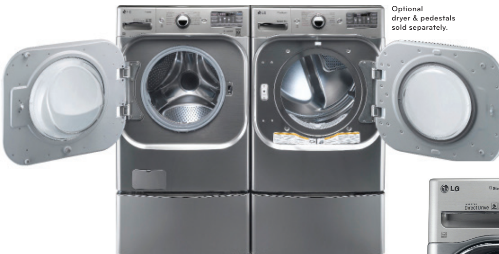
Optional dryer & pedestals sold separately.