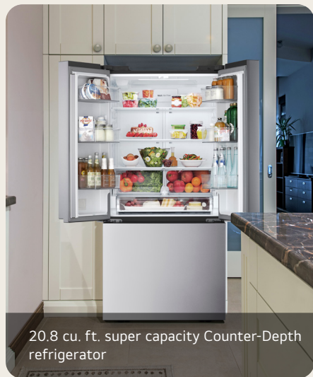
20.8 cu. ft. super capacity Counter-Depth refrigerator

33" 25.1 cu. ft. Standard-Depth 3-door french door refrigerator