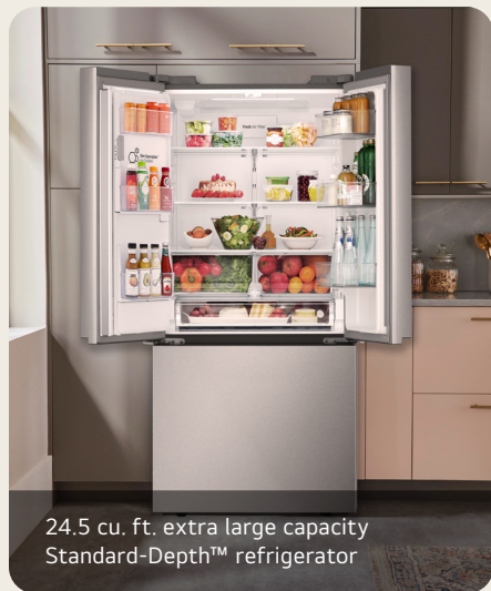
24.5 cu. ft. extra large capacity Standard-Depth™ refrigerator

33" 24.5 cu. ft. Standard Depth 3-door french door refrigerator