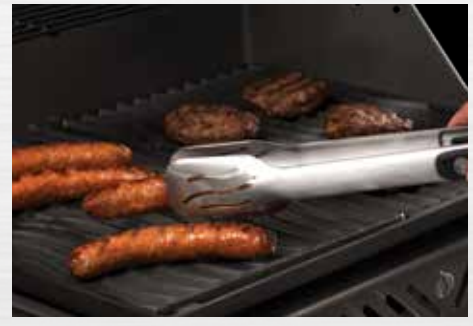
2 Piece Toolset