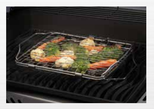
Flexible Grill Basket