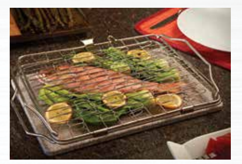
Healthy Choice Starter Kit 90003