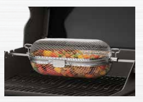
Rotisserie Grill Basket 64000