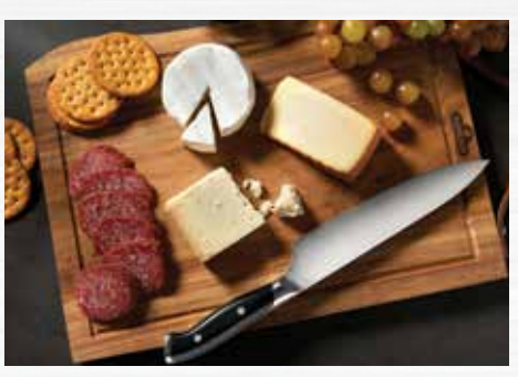
Premium Cutting Board and Knife Set 70039