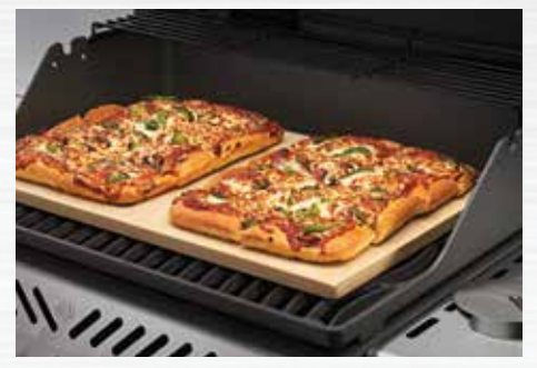
Rectangular Baking Stone 70008