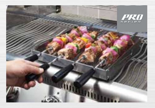
PROStainless Steel Rotating Skewer Rack 70014