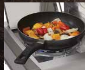
RANGE SIDE BURNER (SB MODELS)