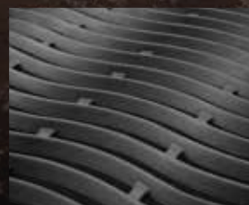
PORCELAINIZED CAST IRON WAVE™ REVERSIBLE CHANNEL COOKING GRIDS (EXCLUDING SIB MODELS)