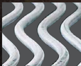
STAINLESS STEEL WAVE™ COOKING GRIDS (SIB MODELS)