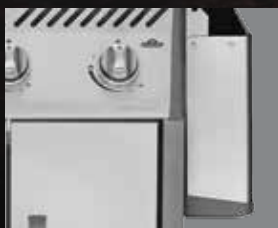
FOLDING SIDE SHELVES