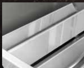
DUAL-LEVEL STAINLESS STEEL SEAR PLATES