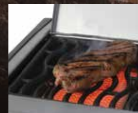
INFRARED SIZZLE ZONE™ SIDE BURNER (SIB MODELS)