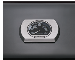
ACCU-PROBE™ Temperature Gauge