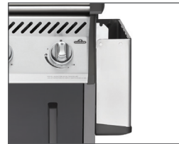
Folding Side Shelves