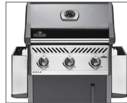
Folding Side Shelves