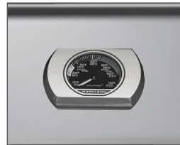
ACCU-PROBE™ Temperature Gauge