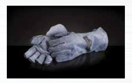
GENUINE LEATHER BBQ GLOVES