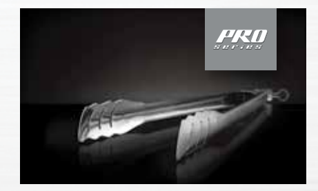
STAINLESS STEEL EASY LOCKING TONGS