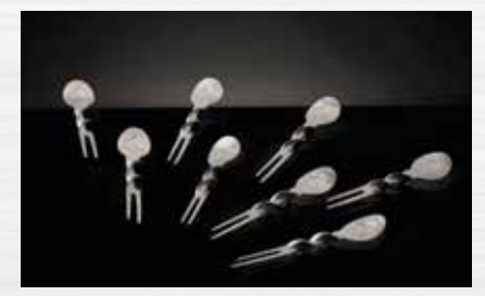
APPETIZER SERVING SET AND CORN FORKS 70041