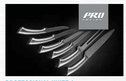
PROFESSIONAL KNIFE / CARVING SET