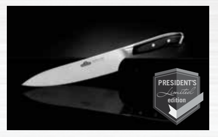
EXECUTIVE CHEF KNIFE