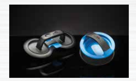
GOURMET BURGER PRESS KIT