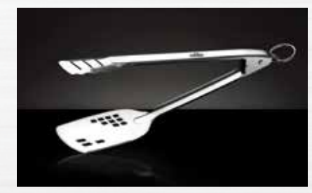
STAINLESS STEEL SPATUTONG 55019