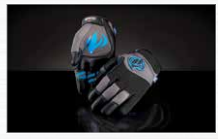
MULTI-USE TOUCHSCREEN GLOVES 62141 (S/M) 62142 (L) 62143 (XL / XXL)