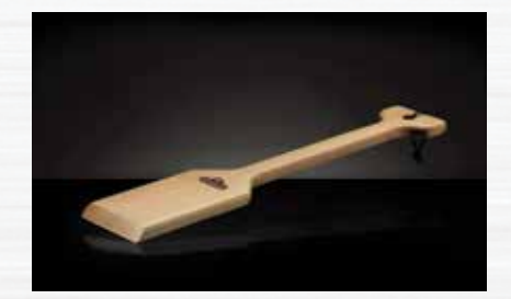
CEDAR GRILL SCRAPER 62051