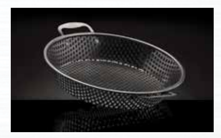
STAINLESS STEEL GRILLING WOK