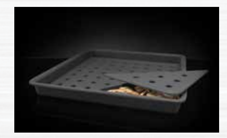
CAST IRON CHARCOAL TRAY 67732