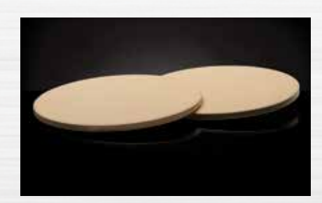
10" PERSONAL SIZED PIZZA / BAKING STONE SET