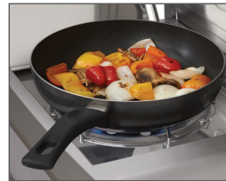
Range Side Burner