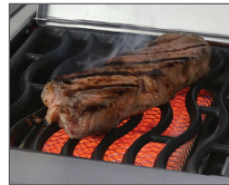
Infrared SIZZLE ZONE™ Side Burner