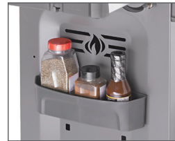
Spacious Storage Basket