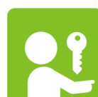
Child Lock (Electronic)