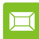
0.9 Cuft Capacity