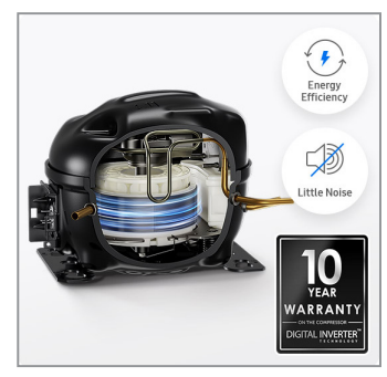
Digital Inverter Compressor