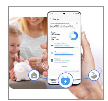
SmartThings AI Energy

Fingerprint Resistant Finish Avoid smudges with fingerprint resistant stainless steel.