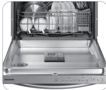
Stainless Steel Interior Door