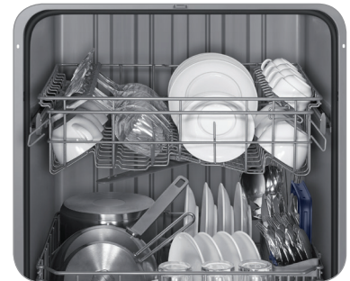
Height-Adjustable Upper Rack