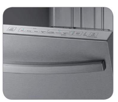
Digital Touch Controls