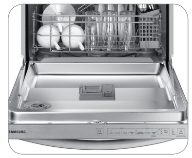
Stainless Steel Interior Door