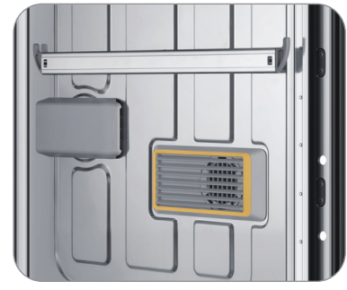
Smart Dry with AutoRelease™ Door

Fingerprint Resistant Navy Steel (panel sold separately)