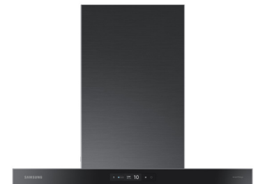
Clean Deep Charcoal Panel/ Black Stainless Steel Duct