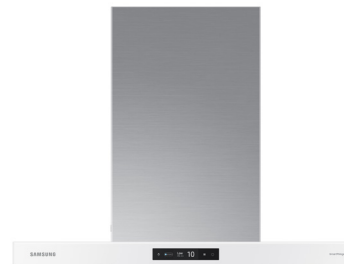
Clean White Panel/ Stainless Steel Duct