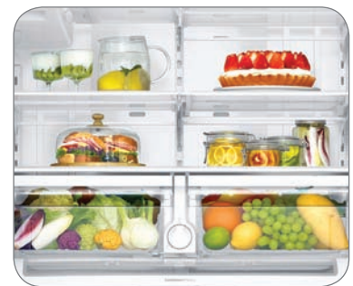
Cool Select Pantry™