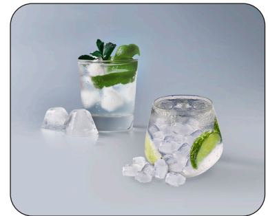
Dual Ice Maker with Ice Bites