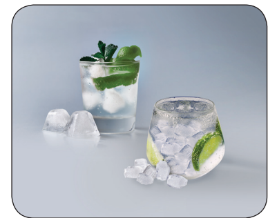
Dual Ice Maker with Ice Bites