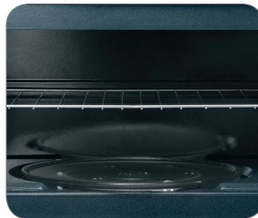
Ceramic Enamel Interior