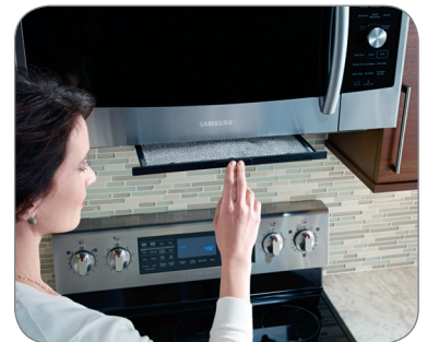
Simple Clean Filter