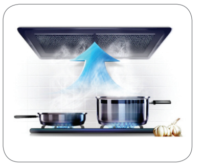
2-Speed/300 CFM Ventilation System