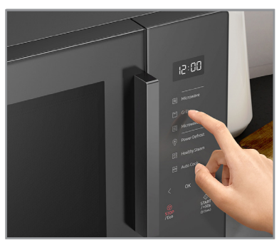
Glass Touch and Simple UX