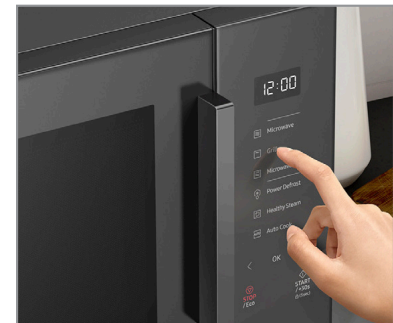
Glass Touch and Simple UX