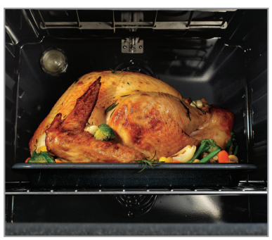
6.3 cu. ft. Capacity