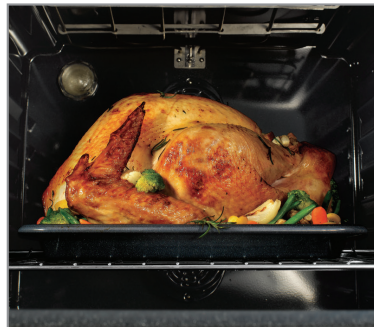
6.3 cu. ft. Capacity