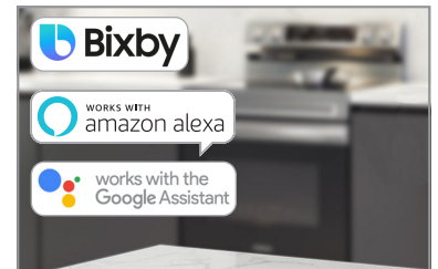
Wi-Fi Connectivity and Voice Control