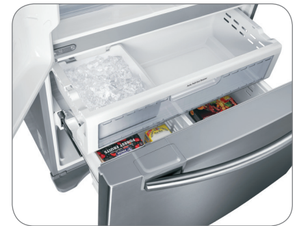
Automatic Filtered Ice Maker in Freezer (External Filter Not Included)