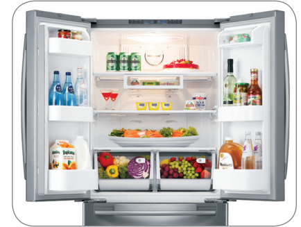
French Door Design