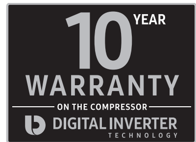
Digital Inverter Compressor