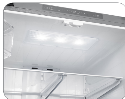
High-Efficiency LED Lighting