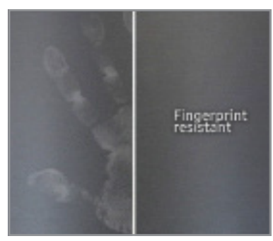
Fingerprint Resistant Finish