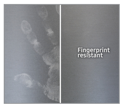
Fingerprint Resistant Finish