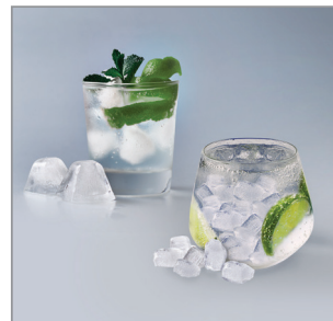
Dual Ice Maker with Ice Bites™