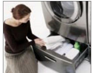
Optional Convenient 15" Pedestal

Design and specifications are subject to change without notice. Non-metric weights and measurements are approximate.