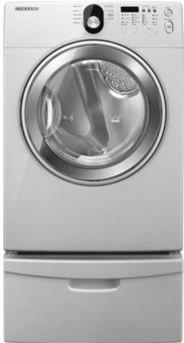
(Shown with optional pedestal)

Samsung DV218 dryer offers sensor drying technology and a Wrinkle Prevent option to reduce wrinkles and refresh clothing.