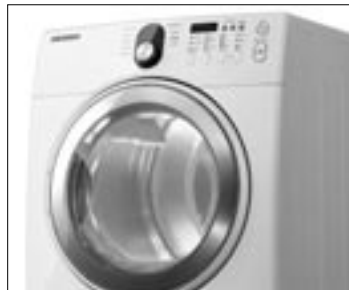
DOT LED Center Jog Dial