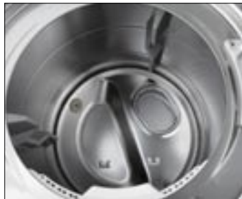
Large 7.3 cu. ft. Capacity and Stainless Steel Drum