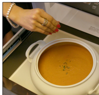
Generous 17" x 16" interior is perfect for platters, casseroles & serving bowls.