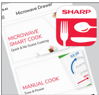
SHARP KITCHEN MOBILE APPLICATION keeps you in control.

The SMD2479KSC Sharp Microwave Drawer oven features Built-In Airflow venting. Now you can choose the traditional "proud mount" installation or flush mounting for a streamlined finish without additional trim kits or vent deflectors. The optional pedestal accessory for the SMD2479KSC slides into a standard dishwasher cutout for a built-in look without the need for custom cabinetry.