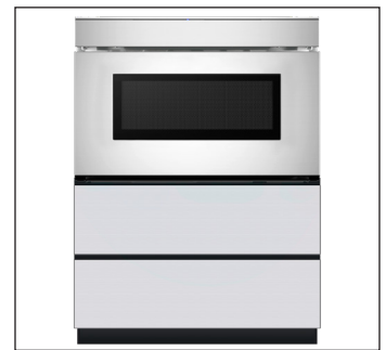
Pedestal Accessory slides under the counter for hassle-free installs.