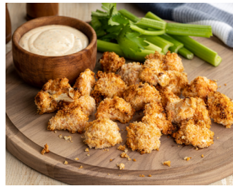
Air Fryer foods with ease achieving a moist inside and crispy golden-brown outside