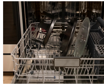
Dishwasher Safe Air Fry Basket, Baking and Roasting Pan and turntable