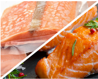
Multi-stage cooking, accommodates up to three functions for defrosting, cooking, and crisping, all in one seamless operation

With decades of experience designing innovative cooking appliances, it's easy to see why home cooks throughout the world trust SHARP. Now that is Simply Better Living.