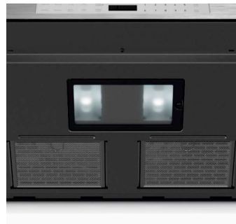
Easy-to-access, sliding grease filters allow for effortless, hassle-free replacement