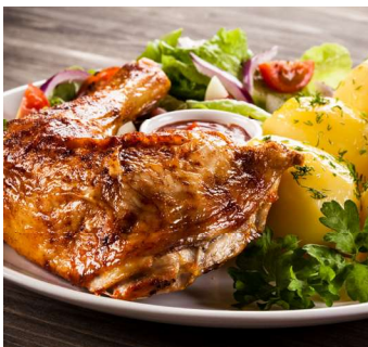
Generous, 1.4 cu. ft.* oven makes it easy to reheat larger dishes

The powerful, 2-speed ventilation system is effective up to 300 cu. ft. per minute (300 CFM) and can be configured to ducted venting or ductless recirculation. The SMO1461GS also features easy-to-reach, easy-to-replace charcoal, and grease filters. With decades of experience designing innovative cooking appliances, it's easy to see why cooks around the world trust Sharp.