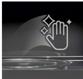
The gray interior adds an elegant touch to your modern kitchen