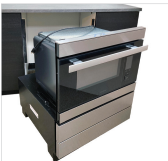
Optional, 2-drawer Pedestal slides into a standard dishwasher cutout for hassle-free installation.

Cleanup is a breeze with two preset cleaning modes. There is even a sterilize option for canning jars, small cutting boards, and utensils. The removable reservoir means no special plumbing or wet-wall installation is required. And with a common 120V power requirement, you can simply plug it into a regular outlet, and you're ready to go.