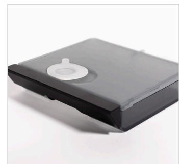
The compact, removable 24 oz. water tank is lightweight, easy to fill, and convenient to access.

SHARP ELECTRONICS CORPORATION 100 Paragon Drive, Montvale NJ, 07645 1.800.237.4277 • www.sharpsusa.com