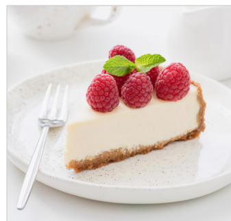
Steam Bake Water Bath is for creamy desserts, like cheesecake, without the hassle of handling hot pans of water.