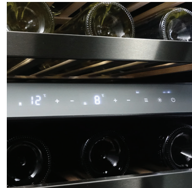
Seamless Capacitive Touch Controls