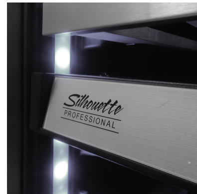
LED Perimetrical Lighting