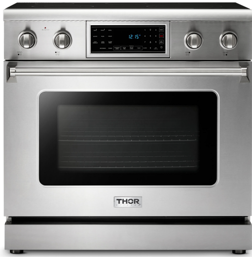
Product: 30 Inch Tilt Panel Professional Electric Range Model Number: TRE3601