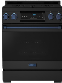
BLUE RSG30B-BLU / RSG30BLP-BLU