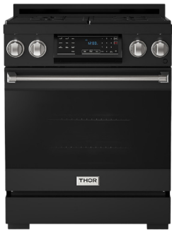
STAINLESS STEEL RSG30B-SS / RSG30BLP-SS