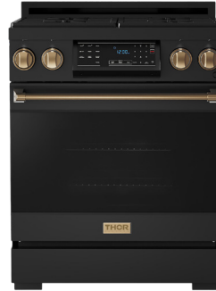
BRONZE RSG30B-BRZ / RSG30BLP-BRZ