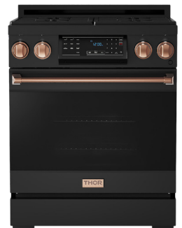
ROSE GOLD RSG30B-RSG / RSG30BLP-RSG