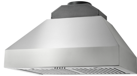
Product: 30 Inch Wall Mount Hood Model Number: TRH30P