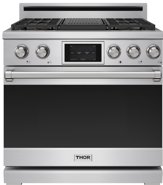
Product: 36 INCH PROFESSIONAL DUAL FUEL RANGE Model Number: XRD36E