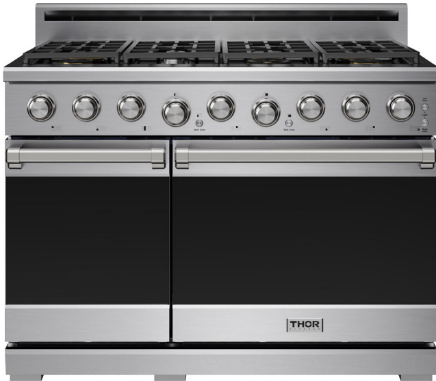
Product: 48 Inch Professional Gas Range Model Number: XRG48E