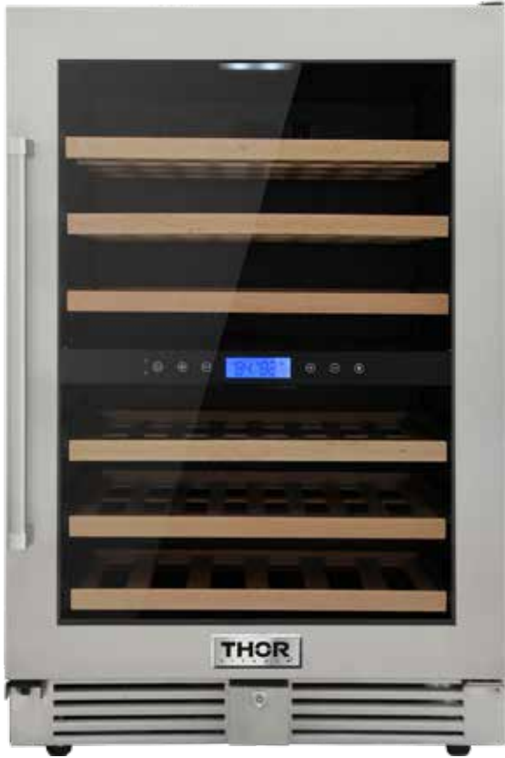
Product: 24 Inch Dual Zone Indoor/Outdoor Wine Cooler