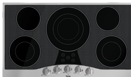
36" WIDE ELECTRIC COOKTOP