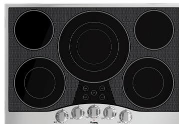
30" WIDE ELECTRIC COOKTOP