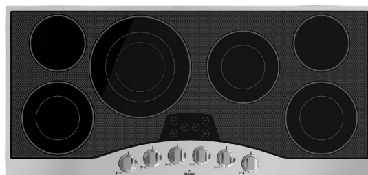
45" WIDE ELECTRIC COOKTOP