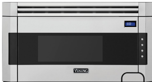
30" WIDE CONVENTIONAL MICROWAVE HOOD