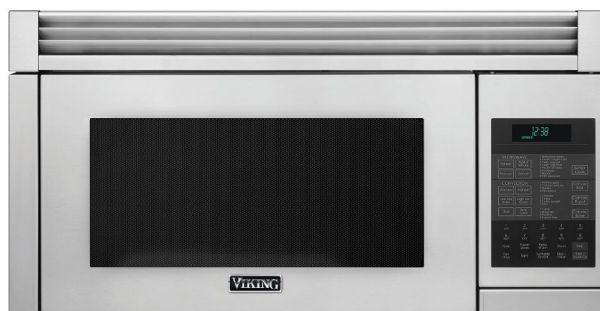
30" WIDE CONVECTION MICROWAVE HOOD