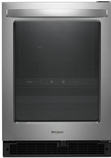
Fingerprint-Resistant Stainless WUB50X24HZ