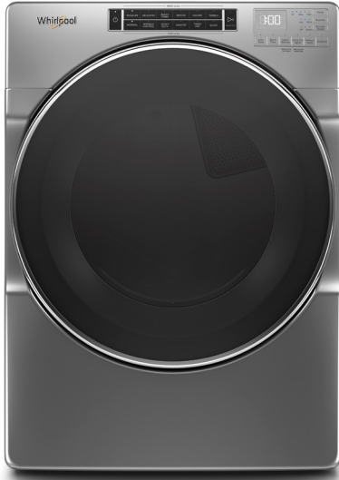
Chrome Shadow WGD8620HC