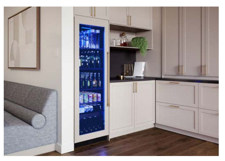
Accommodates custom wood overlay panels