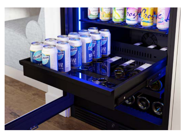
Full-Extension Rollout Bin with Transparent-Gray Glass